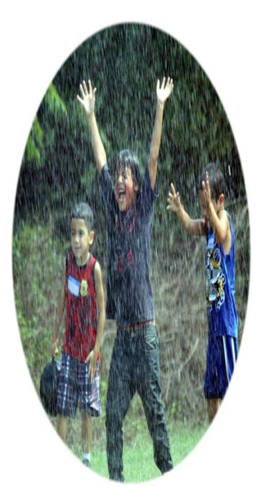
Henrico Cares program partnered with the Henrico Fire and Parks & Recreation at a community event to make it rain for the children.

gestions to assist other agencies: 1) Agencies need time to assess themselves, 2) Agencies need to prioritize efforts caused by the competing interests, 3) Agencies should utilize colleagues & form cohorts for similar tasks, 4) Identify customers and address their situations (avoid labeling children & families), 5) Be strength based, 6) Educate community partners, 7) Elicit support of sister agencies in localities, i.e. Mental Health & Juvenile Justice, 8) Involve locality government by engaging, informing, and to support messaging, 9) Develop a plan, and 10) Work the plan.